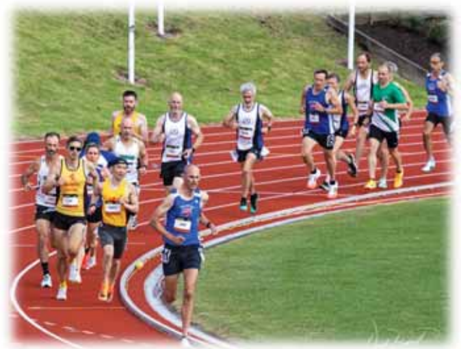
More photos can be found on the Cooks Classic Facebook page.