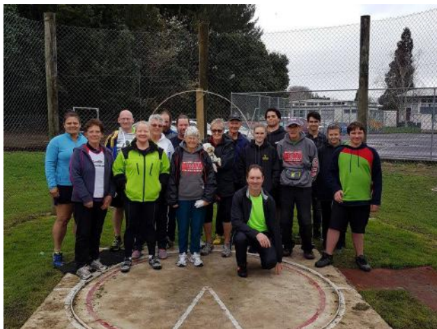
Group photo of competitors

With the wet and bogging ground it was easy to see where the weight and shot put landed. The rain let up in the afternoon for a short while when we were ready for the last event and a group photo.