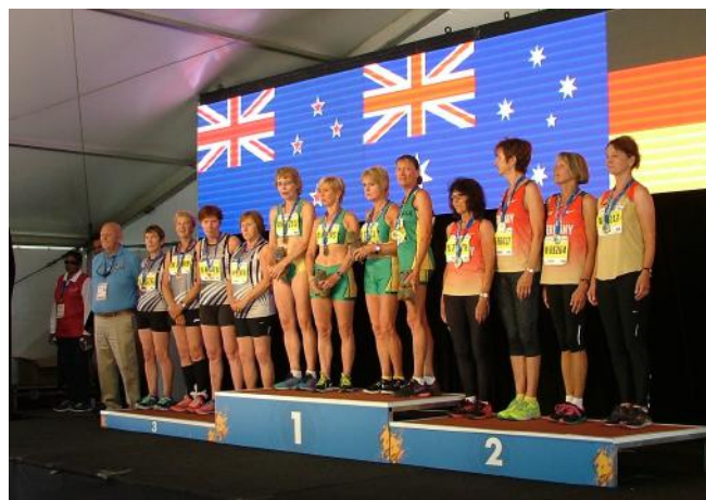
New Zealand team Bronze medal W65 4x 100m Relay