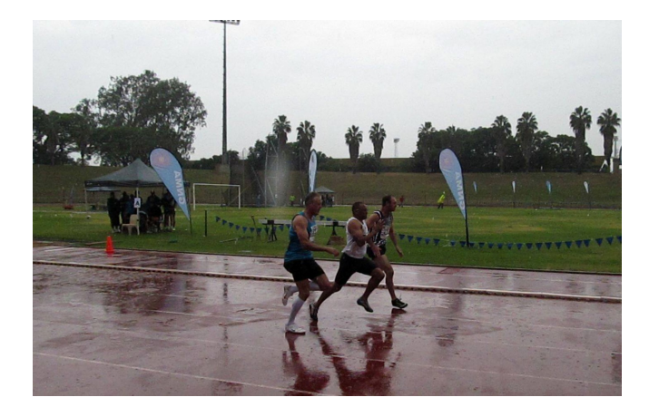
Running the 100m in the rain Silver medal