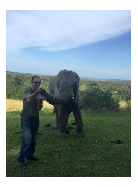
With Elephant Game Farm