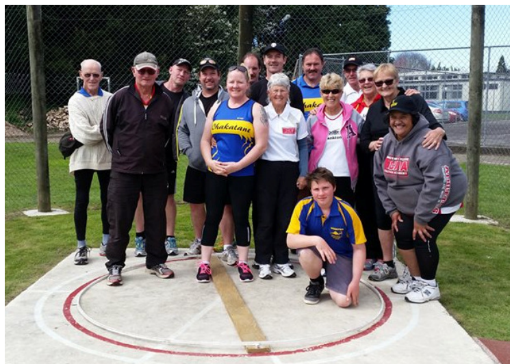
A happy group of Throwers

Our Summer track season is off to a fine start with our first track and field meeting. It was the Sunday in Labour Weekend holiday so we were unsure just how many folk would join in. We had at least 25 competitors so we were thrilled with that, great weather too. Plenty of race distances to have a try at, seven track race distances from 60m to 2000m, all hand timed and five throwing events to keep folk busy.