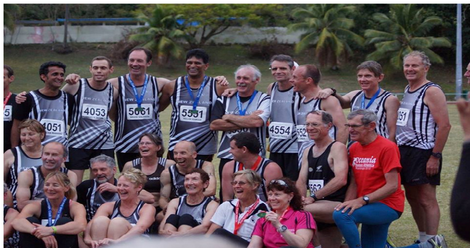
A very happy looking New Zealand team